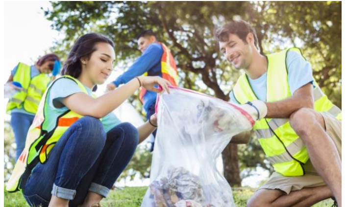
THE GREAT GLOBAL CLEANUP™